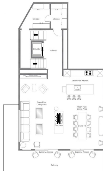
CHALET 4, 7 HEAVENS, TOP FLOOR FLOOR - FOR ILLUSTRATION PURPOSES ONLY