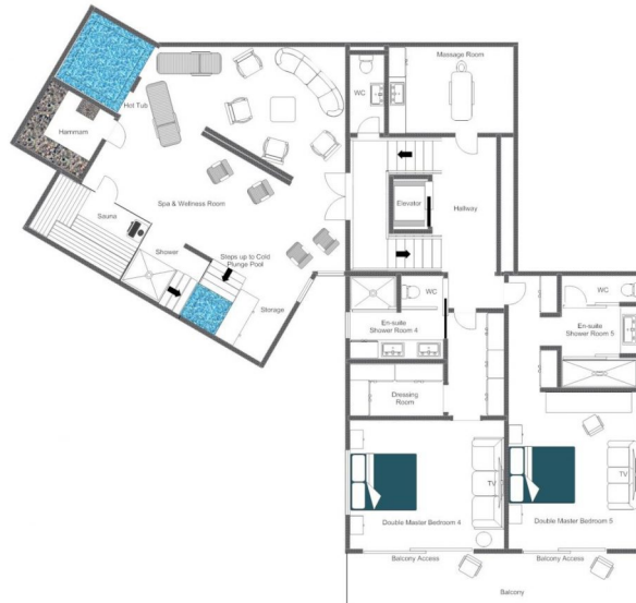
CHALET 4, 7 HEAVENS, SECOND FLOOR - FOR ILLUSTRATION PURPOSES ONLY